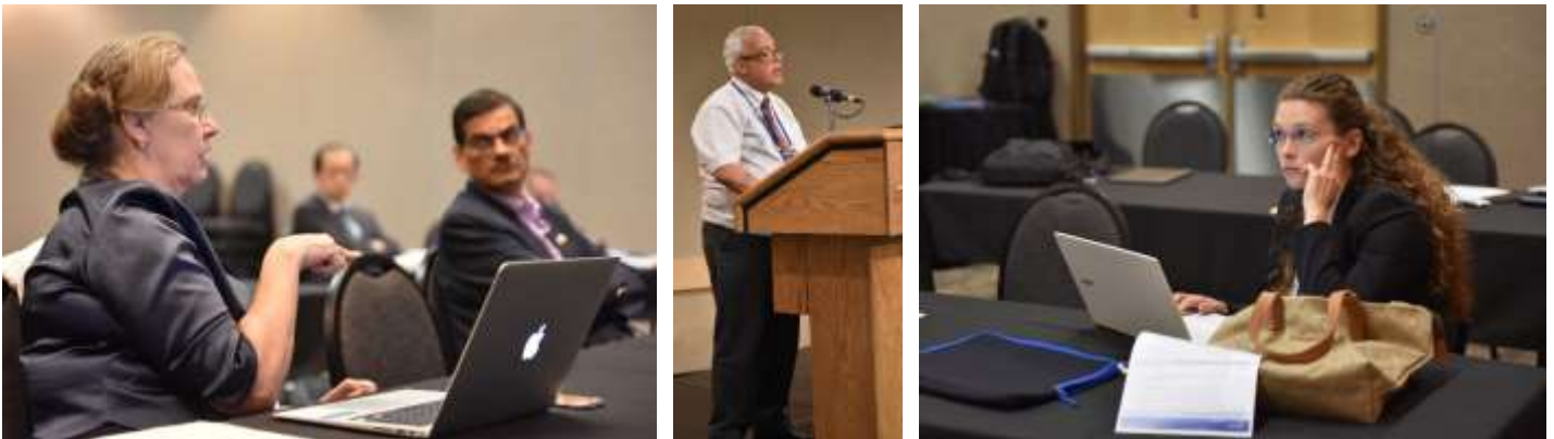
Participants and Presenters at today's FAO Sessions and ICID Meetings.

The various working groups of ICID also met today to discuss the strategic sub-themes of On-Farm, Basins, Knowledge, Schemes. A meeting of the Permanent Committee on Strategy and Organization (PCSO) was also held. The PCSO is responsible for increasing the number of member countries and assisting the National Committees to become more active in their own countries to achieve the goals set for them from time to time by the Council.