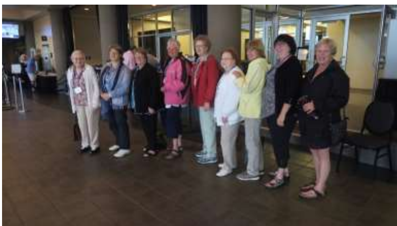
Participants in the Accompanying Persons Program had fun today at the Western Development Museum.

Several tours have been organized for accompanying persons over the past few days. Today, nine individuals visited the Saskatchewan Western Development Museum.